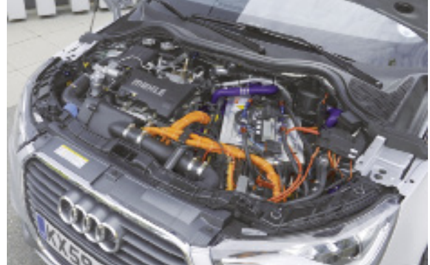
>> Range extender engine

The range extender demonstrator vehicle is fitted with a compact, lightweight range extender engine and is developed to address EV range anxiety. This hybrid allows for efficient energy usage and the potential for long distance driving, with the range extender engine running as required to sustain the battery charge, further extending the vehicle range.