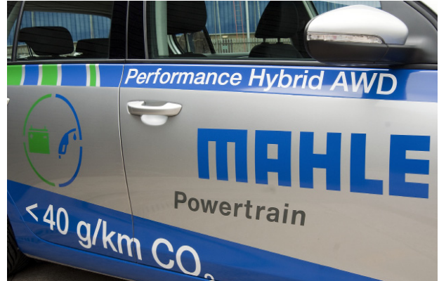
›› Parallel hybrid demonstrator vehicle