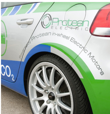
>> Protean in-wheel electric motors