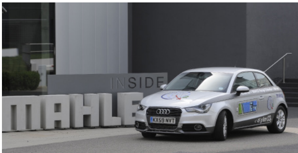
>> MAHLE Range extender demonstrator vehicle