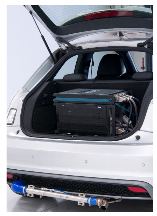
>> PEMS equipment setup in trunk of Audi A1