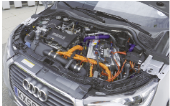
>> Range extender engine in demonstrator vehicle