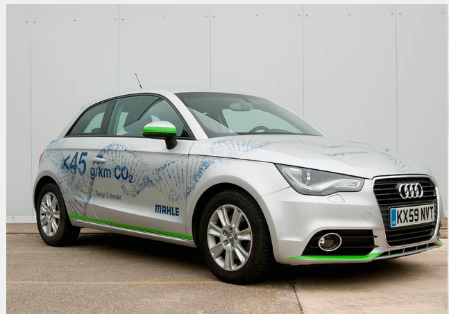
>> MAHLE range extender demonstrator