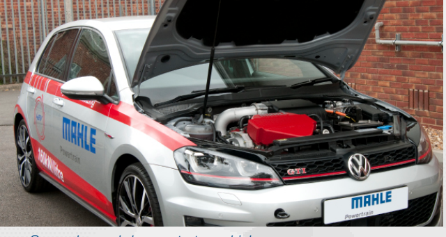
>> eSupercharged demonstrator vehicle

MAHLE ZG Transmissions Georg-Kollmannsberger-Str. 3 85386 Eching Germany Tel. +49 89 18 94 169-0