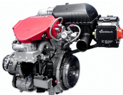
>> eSupercharged downsizing engine

This eSupercharged engine has been installed in a demonstrator vehicle developed by MAHLE Powertrain. The 48 V platform used in this application comprises a 3-cell advanced lead acid battery pack, a DC/DC converter to maintain the state of charge of the 12 V battery (which supports the existing 12 V systems), the eSupercharger and a 10 kW BISG (belt integrated starter generator). The latter provides continuous electrical power to the eSupercharger, even when the 48 V battery is depleted. The combination of a heavily downsized gasoline engine, together with the 48V hybridisation applied to this demonstrator vehicle, is expected to yield a combined CO2 reduction of 25 % over the NEDC.