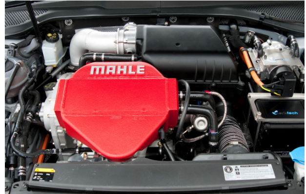
>> eSupercharged downsizing engine

MAHLE Powertrain's eSupercharged downsizing demonstrator vehicle provides very high specific output and improved fuel economy. This vehicle employs mild hybridisation with a 48 V battery, electric supercharger and 48 V belt starter generator (BSG). This provides excellent transient response at low speed for enhanced driveability, coupled with reduced CO 2 emissions over legislated drive cycles. The BSG enables energy recuperation during deceleration and braking to maintain useful energy levels in the battery.