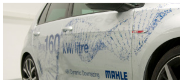
>> eSupercharged downsizing demonstrator vehicle