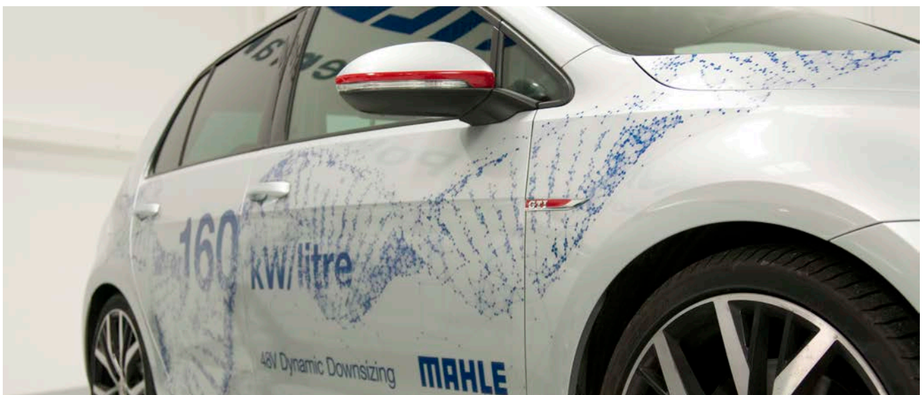
eSupercharged Demonstrator Vehicle