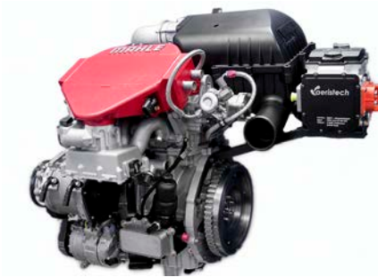
↑ eSupercharged Downsizing Engine

MAHLE Powertrain has integrated a 48 V eSupercharger into their latest downsized engine, along with a conventional exhaust driven turbocharger for high speed, full load performance.