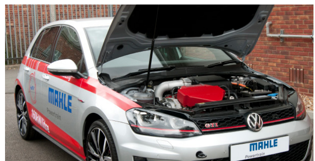
>> eSupercharged demonstrator vehicle

MAHLE Powertrain's eSupercharged downsizing engine provides high performance with a 48 V electric supercharger in combination with a conventional turbocharger. Whilst delivering high output along with fast response times and high torque at low speed, this engine achieves low emissions and excellent fuel economy.